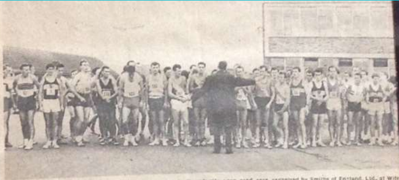
Last minute instructions for those taking part in the 12-mile open road race, organised by Smiths of England, Ltd., at Witney